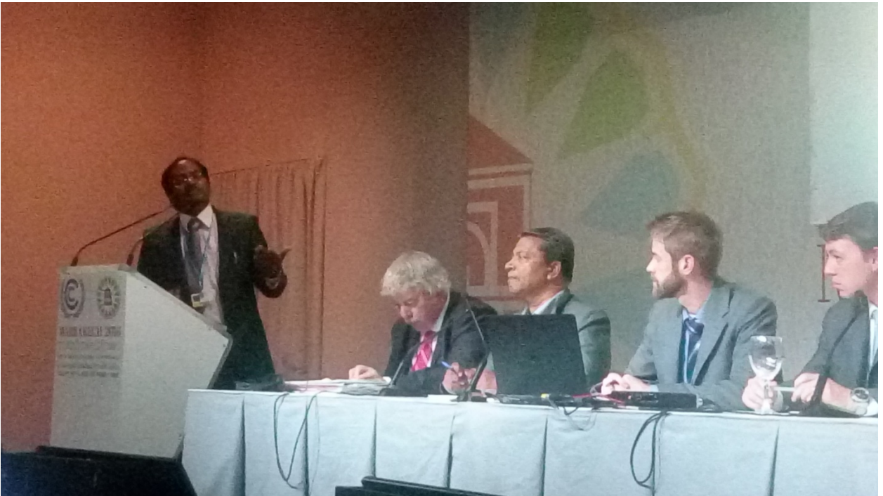
2.3 Climate Change Adaptation Strategies at India Pavilion, organized by the Ministry of Agriculture and Farmer Welfare.

The NCCSD actively participated in the Climate Adaptation Strategy Event organized by the Ministry of Agriculture on 10<sup>th</sup> of November, 2016. The